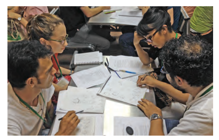
Figure 6. A team of mathematicians from Universidad del Amazonas, Universidad del Cauca, University of Kentucky, and Fundación Universitaria Konrad Lorenz working on a problem set in discrete geometry during ECCO 2016.

ECCO 2016 was a CIMPA Research School and hosted 130 participants from over twenty countries, mostly from Latin America. Now that ECCO has gained some international notoriety, several combinatorics experts have asked to attend. We welcome them with care, reminding them that this is a school and an encuentro ,<sup>3</sup> not a regular conference. We ask these experts to do problem sets with the students, to present open problems that they would like help with, to serve as mentors, and probably to join the dance floor at some point. They have been