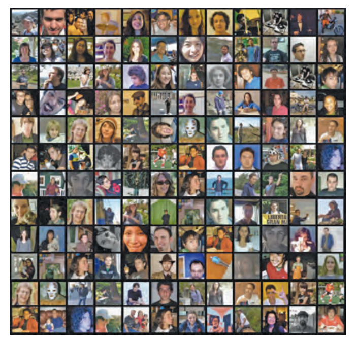
Figure 1. A diverse group of more than two hundred mathematicians comprises the SFSU-Colombia Combinatorics Initiative.

For permission to reprint this article, please contact: reprint-permission@ams.org. DOI: http://dx.doi.org/10.1090/noti1434