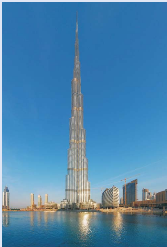
Figure 2. The Burj Khalifa in Dubai, United Arab Emirates (UAE), is, at 828 m, the tallest building in the world. Opened in January 2010, it took more than five years to build. The design includes a variation of cross section with height to help ensure that vortices are not shed coherently along the entire height of the structure. Khalifa bin Zayed Al Nahyan, for whom the burj (tower) is named, is the president of the UAE.

to a period of 5 seconds. For a 100-story building, f_b is in the range of 0.1–0.125 Hz, corresponding to a period of 8–10 seconds, but some super-tall structures have been conceived for which the frequency is as low as 0.05 Hz, corresponding to a 20-second period.